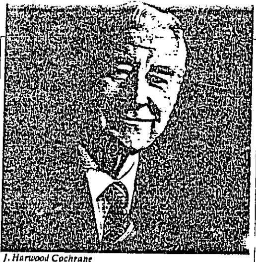
"If the economy comes back strong . . . there won't be enough trucks to handle the freight"

trucking company more difficult-putting a premium on the quality of individual managements. Second, it greatly reduced the trucking industry's profitability,